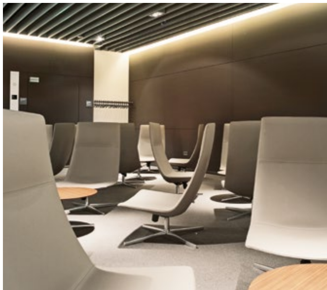
1 Hamilton Grange Teen Center New York Public Library NYC, USA Art. 2011