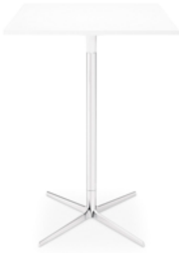
TABLE 1: MATERIALS OF GINGER WITH SQUARE WHITE TOP AND PAINTED ALUMINIUM BASE